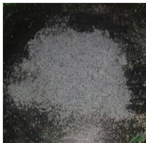
Fig. 1 Proposed composition