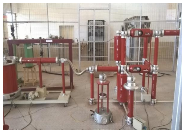
Fig.3 Electrostatic discharge