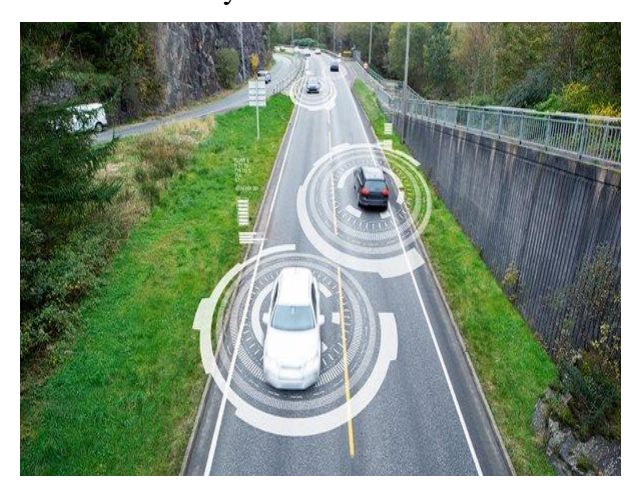
Fig.3. Showing the scope of the Vehicle

organizations, to empower a scope of abilities. For instance, car IoT empowers rapid vehicle-to-vehicle and vehicle-to-framework correspondences to trigger the accompanying outcomes, huge numbers of which are conceivable today: