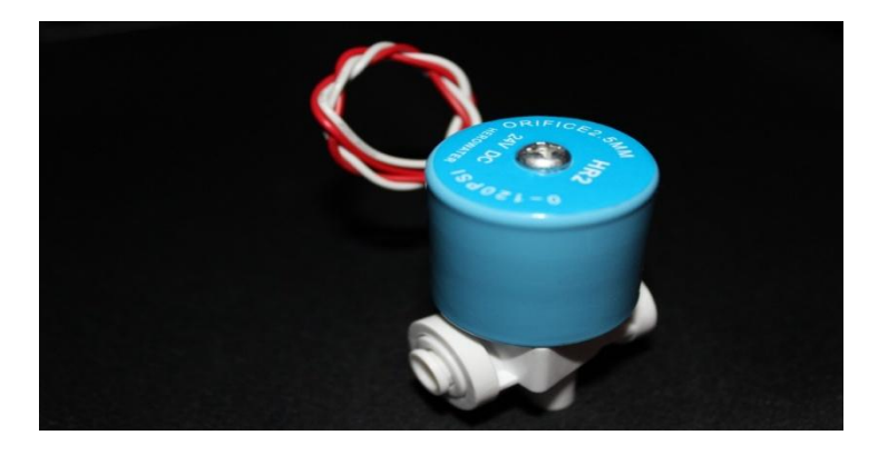
Fig.2 Water & Gas controller sensor

A magnetic field is generated by an electric current through the coil. A force is exerted on the plunger by the magnetic field. As a consequence, the plunger is pushed toward the coil centre so that the orifice opens. This is the underlying concept used to open and shut solenoid valves. When the ignition switch is turned on, a small electric current is sent through the starter solenoid. This causes the starter solenoid to close a pair of heavy contacts, thus relaying a large electric current through the starter motor, which in turn sets the engine in motion. Water taps and shower is automated using electric solenoid valve, IR sensor and relay. IR sensor is placed just below the water outlet so that it can sense our hand below the tap and switch the valve to flow water. Solenoid is the generic term for a coil of wire used as an electromagnet. It also refers to any device that