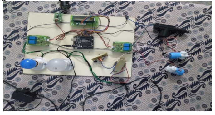
Fig.3 Structural Layout Diagram of the System