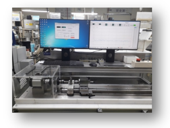
FIGURE 3. Realtime process inspection system