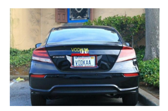
FIGURE 10. Example using a regular text license plate.