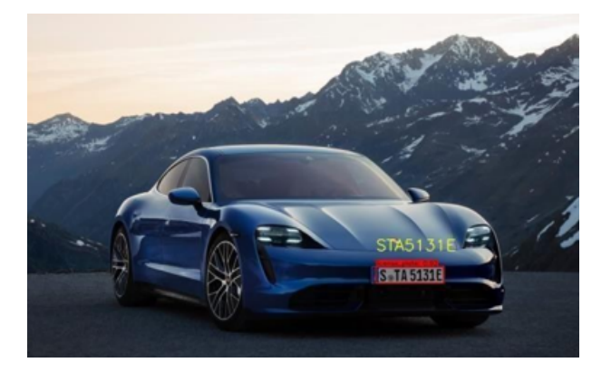
FIGURE 11. Example using license plate with similarly shaped characters (5 and S).