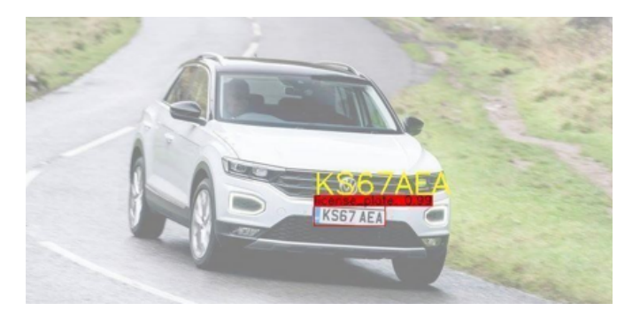
FIGURE 12. Example using a license plate in foggy conditions with 50% visibility.