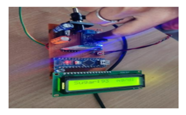
FIGURE 4. Experimental setup