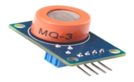
FIGURE 2. Breath analyzer sensor

hardware setup. It is designed to detect and measure the composition of breath, particularly the concentration of volatile organic compounds (VOCs) that can provide insights into the user's health status. This sensor typically consists of a capacitive sensing element that interacts with the breath sample which is shown in the figure 2. As the VOCs in the breath come into contact with the sensing element, they cause changes in the capacitance, which can be measured and correlated with different breath parameters, such as alcohol levels or ketone levels.