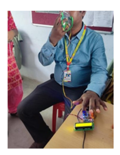
FIGURE 5. Real time hardware experimental testing

The hardware setup includes a potentiometer to measure the conductivity as voltage. The Arduino Nano microcontroller is utilized to convert the analog signal to a digital voltage value. A mathematical equation is established to establish the relationship between the pulse rate, respiration rate, voltage, and glucose level. This equation is programmed into the Arduino Nano, and the resulting glucose value is displayed on an LCD display. The obtained glucose value is compared with the normal reference blood