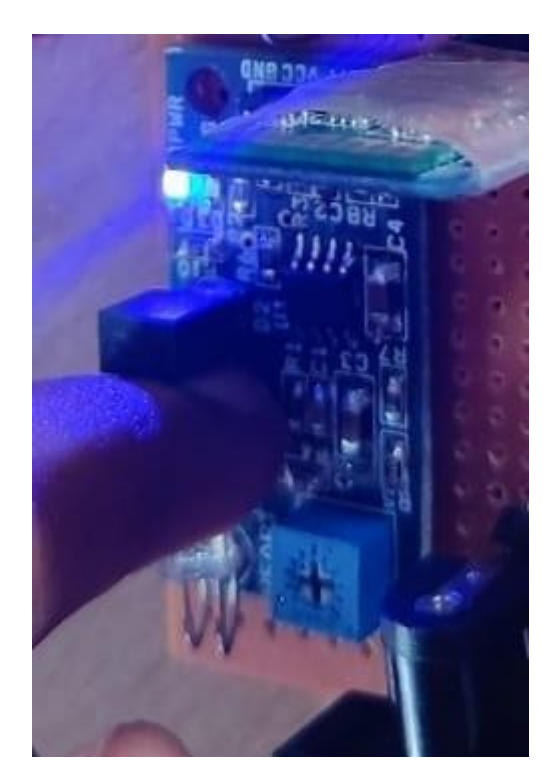
FIGURE 3. Photoplethysmography

Potentiometer: A potentiometer, also known as a variable resistor, is utilized for calibration and