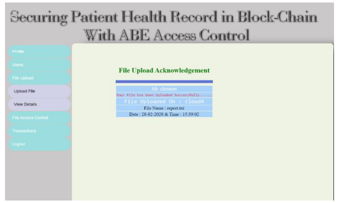
Fig.2.Cloud file storage

Step 3: Now an acknowledgement message is received and its hows on which cloud the file is stored.