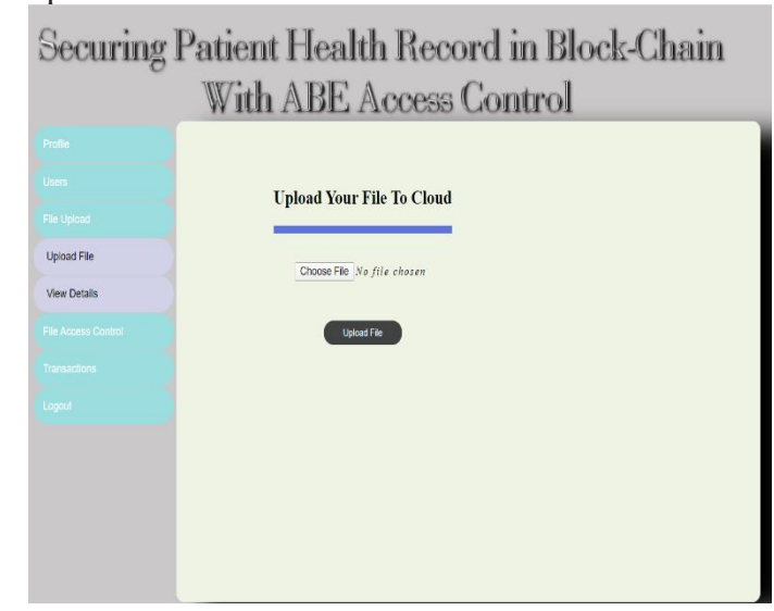
Fig.1. In the EHR system the DATAOWNER is having the privileges to upload.

Step 2: The format of the file should begiven and then choose the file and upload. In the EHR system the DATAOWNER is having the privileges to upload.