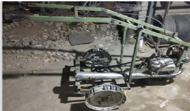
Fig.2. Model for Working